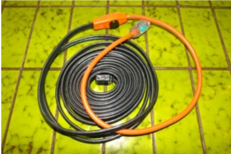
Figure 6. Electric Water Pipe Freeze Protection Cable

Water pipes that are susceptible to freezing (such as exterior runs) should be wrapped with electric water pipe freeze protection cable and then wrapped with insulation. Refer to Figure 6 . This should keep the water flowing down to -40^{\circ}\text{F} ( -40^{\circ}\text{C} ). But if you lose electricity for several hours during extreme cold, this protective will fail.