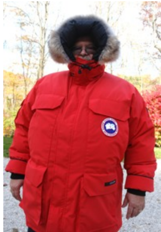
Figure 12. The Polar Expedition Parka

Military "Mickey Mouse" boots will keep your feet warm in extreme cold weather. They can be purchased used, reasonably priced at an Army Surplus store. Black Type I Extreme Cold Weather "Bunny" Boots are designed to be worn in wet or dry conditions down to -20°F (-29°C). White Type II Extreme Cold Weather Boots are suitable cold dry weather in snow or ice conditions down to -60°F (-51°C). These boots were first used by the military during the Korean War. Their most distinguishable features are their giant size. Reminded of the iconic cartoon character, soldiers joked they were in Mickey Mouse's shoes. The black boots are 100% rubber,