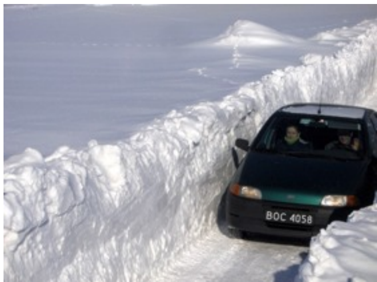
Figure 20. Greater Snow Accumulation

Snow Accumulation: A solar “Grand Minima” can produce greater snow accumulation during the winter because of a heavier build-up of layer after layer of snow with minimal melt-off in-between. This can challenge the ability to drive because the roadway may become impassible as the winter progresses. This is a photograph of abnormal snow accumulation that my niece took in Poland of a country road. Refer to Figure 20 . Generally this threat is greater near large bodies of water such as oceans or large lakes (lake effect snow).