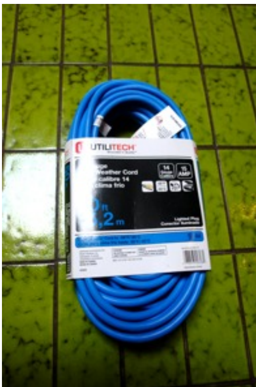
Figure 18. Arctic Blue Cold Weather Cordset

At temperatures colder than 0°F (-18°C), many people also leave their vehicle running overnight. Leaving your car idling uses about four or five gallons of gas, but you don't have to worry about the car starting and it also prevents the interior plastic and vinyl from cracking if it gets bumped accidentally before it has a chance to warm up.