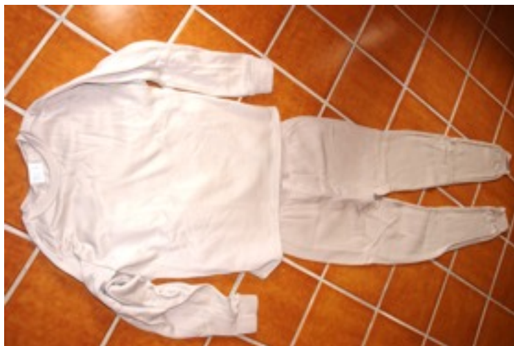
Figure 9. Desert Sand 2 Layer Polypropylene Long Underwear