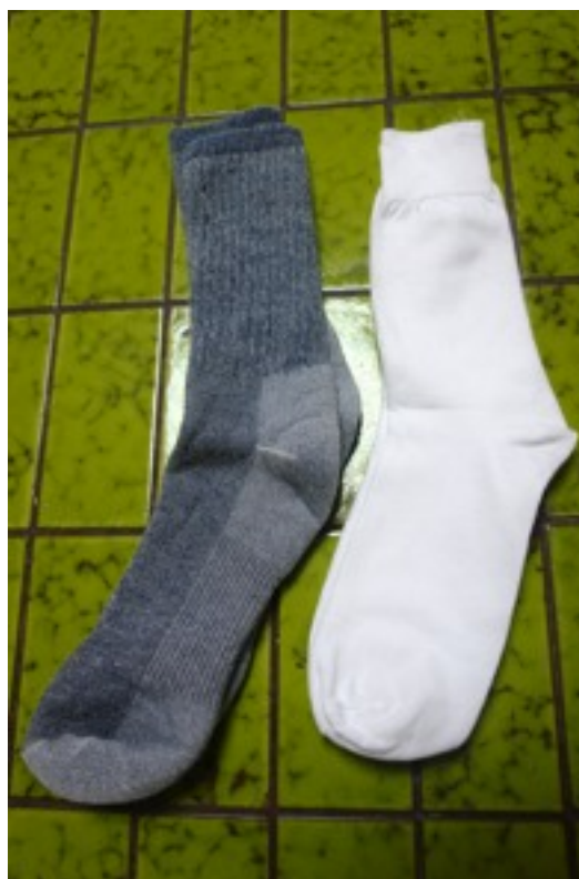
Figure 10. Stockings Right--Thermolite Inner Wick Dry Stocking Liners Left --Outer Outdoor Merino Wool Trail Socks