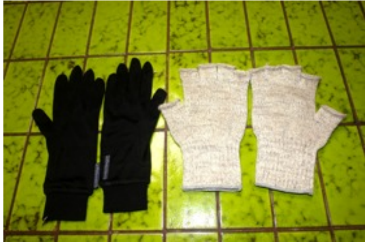
Figure 11. Gloves Left --100% Silk Inner Glove Liners Right --Fingerless Ragg Gloves