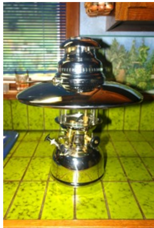
Figure 8. Petromax BriteLyt Lantern, Model 500CP

Cold weather stresses human survival. The death rates from heart attacks (myocardial infarction), stroke and respiratory disease is significantly greater in the winter than the rest of the year.