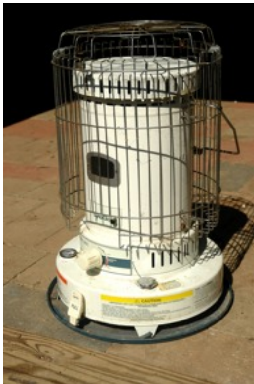
Figure 4. Dyna-Glo 23,000 BTU Portable Kerosene Heater, Model RMC-95C

In a crisis, you do not need to heat the entire home. Reduce the size footprint of your home by closing off areas, rooms that you can live without. Shut doors and stuff towels or rags in cracks under the doors to seal out drafts. Close draperies or cover windows with blankets at night. This can minimize your overall heating requirements.