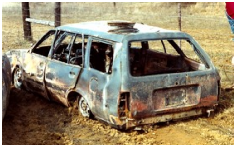
Figure 19. Burnt Out Shell of a Car

When the car will not turn over because the oil in the crankcase is almost as thick as tar, some individuals, take matters into their own hands and ingeniously build a fire under the car. Some use charcoal; others try propane or even