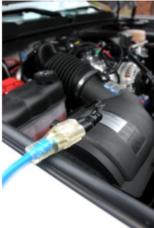
Figure 17. Engine Block Heater Pigtail