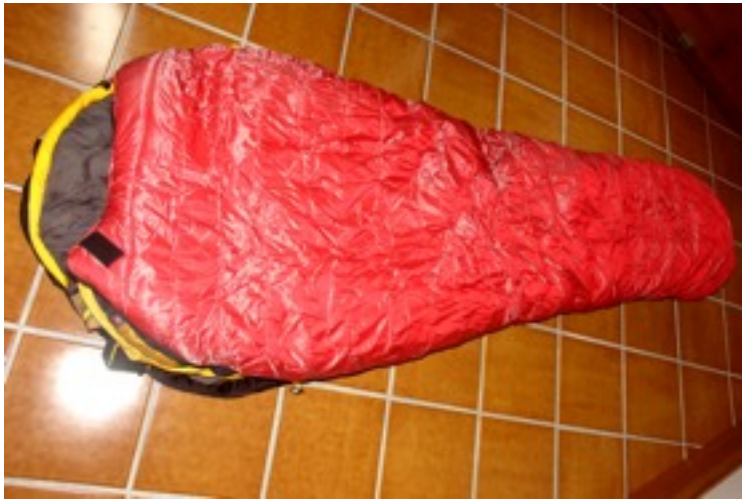
Figure 7. Sleeping Bag - The North Face “DarkStar” rated for -40°F

In cold weather regions, I recommend purchasing sleeping bag rated for the coldest weather your area might potential experience, self inflating sleeping pads and a few down blankets. Sleeping bags are rated for their respective temperature ranges and some are usable down to -40° F or below. Refer to Figure 7 .