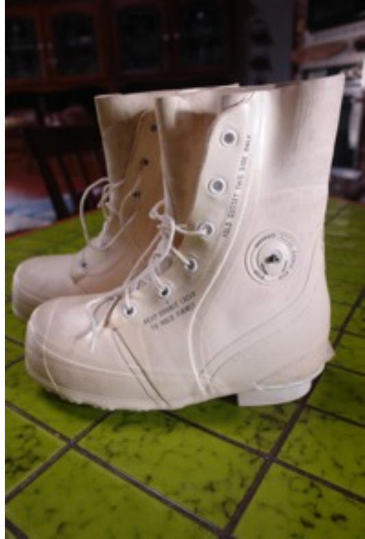
Figure 13. Mickey Mouse White Type II Extreme Cold Weather Boots

with thick wool insulation all around, plus an insulating air pocket all sandwiched between the layers of rubber. The white boots are constructed with insulation consisting of three layers of needle punched polyester foam hermetically sealed within an outer and inner layer of rubber. The boot is provided with a pressure release valve to adjust internal air pressure in the boot during high altitude operations. Refer to Figure 13 .