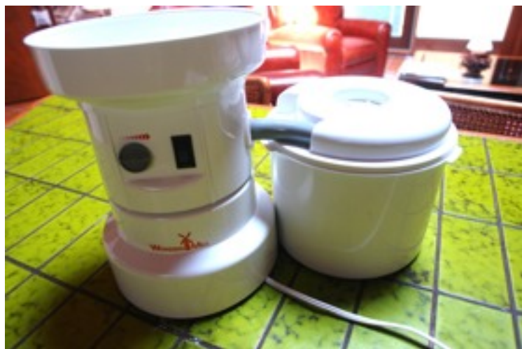
Figure 3. Wonder Mill

Wonder Mill is an electric grain grinder. The mill can grind around 10 cups of wheat into flour in about a minute. This is enough flour to make a couple loaves of bread. Refer to Figure 3 .