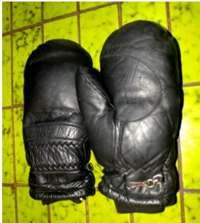
Figure 15. Aris Down Mittens (Deerskin Leather Outer, 100% Nylon Inner, 100% Down Fill)