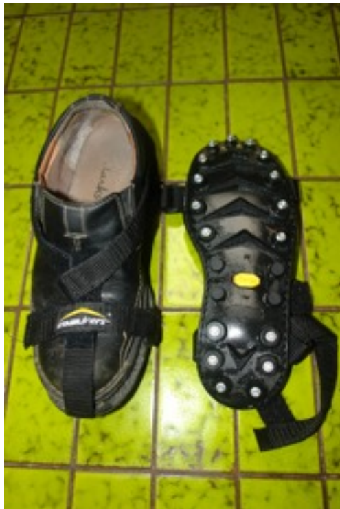
Figure 14. Vibram "STABILicers" Metal Cleats

Remember to take into account the wind chill factor when dressing. The cooling effect of moving air is well known and the phrase "wind chill factor" was coined by the American Paul Siple to describe the fact that wind increases the rate of heat loss and has the effect of making it seem as though it's really colder than the thermometer is showing.