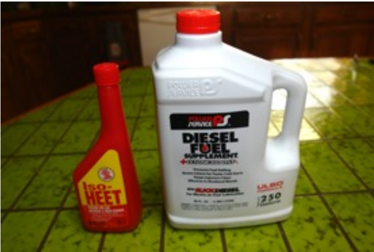
Figure 16. Fuel Antifreeze

Water condensation forms on the inside of the gasoline tank. In cold temperatures, this condensation can freeze and plug the fuel line. Without fuel the engine dies and cannot be restarted. Two methods are commonly used to prevent this problem. First, keep the fuel tank full. This will minimize the area available for condensation to form. Second, add a gas line antifreeze, such as HEET, to the gasoline tank with every fill-up. For diesel engines, an additive such as PS Diesel Fuel Supplement can be used as an anti-icing additive and the supplement also prevents fuel gelling down to -40^{\circ}\text{F} ( -40^{\circ}\text{C} ). See Figure 16 .