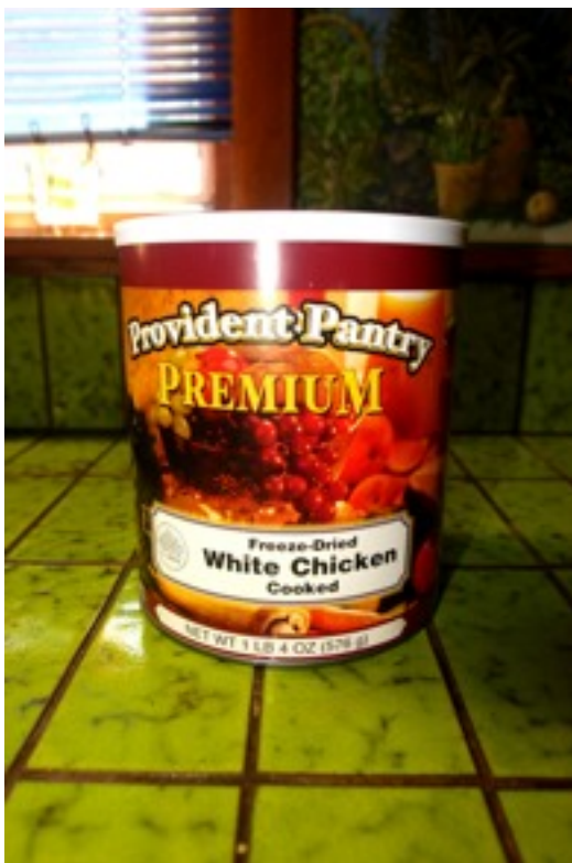
Figure 2. Freeze Dried Chicken

I also recommend purchasing a few Gamma Seal Lids. Once you pop the top off a Superpail, you will need to reseal it between daily uses. Gamma lids provide a quick on-off airtight sealing lid.