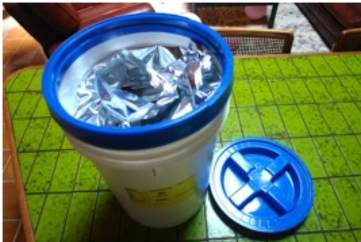
Figure 1. 6-Gallon Superpail, Gamma Lid Removed

and other vermin out. An example of this type of storage is shown in Figure 1 . It is important to keep food in these Superpails stored at as cool and steady a temperature as possible (below 75 degrees but not freezing). Food in this form stored in a cool environment will last 20+ years. Thus you can avoid the problem of constant food rotation. The Superpails are stackable and fit easily inside a closet. I found the cost of this food a little higher than the cost at a grocery store. I recommend rice, beans, peas and lentils because of their ease in preparation (simply cooked in boiling water). Wheat, spelt, barley and oats will generally need to be ground to make flour which will then be processed into bread, pasta, cereals, etc. A grain grinder will be required to process this type of grain into flour. I have bought and used this product and give it my thumbs up.