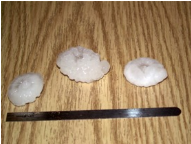
Figure 21. 2-Inch Diameter Hailstones

One day at work a hailstorm hit. This hailstorm was unusual because of the size of the hailstones. Some were 2 inches in diameter or larger. They looked like squashed doughnuts in shape. Taking my life in my hands, I went out into the hailstorm and gathered up a few samples. Then I quickly took them inside and photographed them before they melted. Figure 21 is one of the photographs. These hailstones were of a size that could damage automobiles. In this case they destroyed the side mirrors, windshield and produced many dents on the hood/trunk and tops of vehicles. Individuals at work started calling their insurance companies to report the damage. The response they got from their agents were lackluster. I had sent the hailstone photographs to individuals within my department by email. But they forwarded